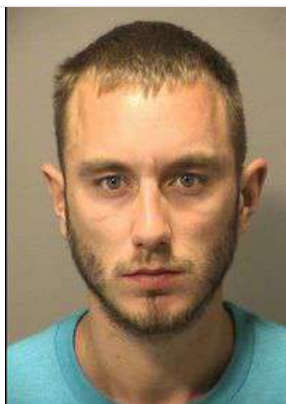
Woman tells jurors she had no reason to fear rape until it was too late

VALPARAISO — A jury deliberated just 10 minutes Wednesday morning before returning with a not guilty verdict against a 22-year-old Portage man, who was charged with raping a former girlfriend in 2015.