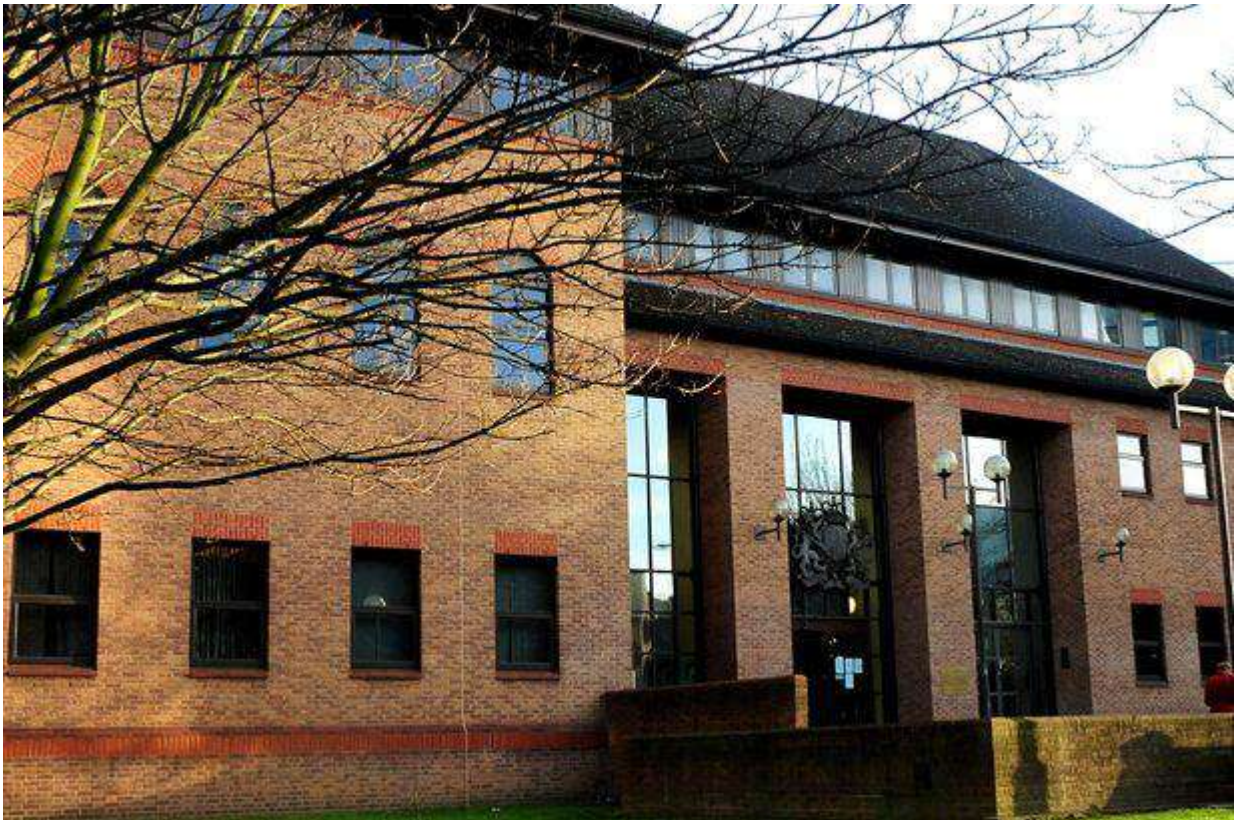
Traumatic Experience: The victim's life 'could have been ruined', Derby Crown Court heard

He said the "most traumatic" time was when he discovered she had lied to his son about the incident and he told the teenager what had really happened.