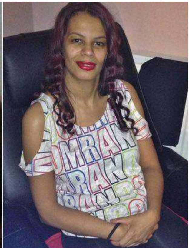
Jailed: A care worker made a false rape allegation about her ex