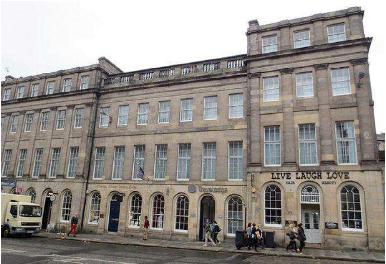
The Travelodge Hotel in Waterloo Place where the alleged incident took place