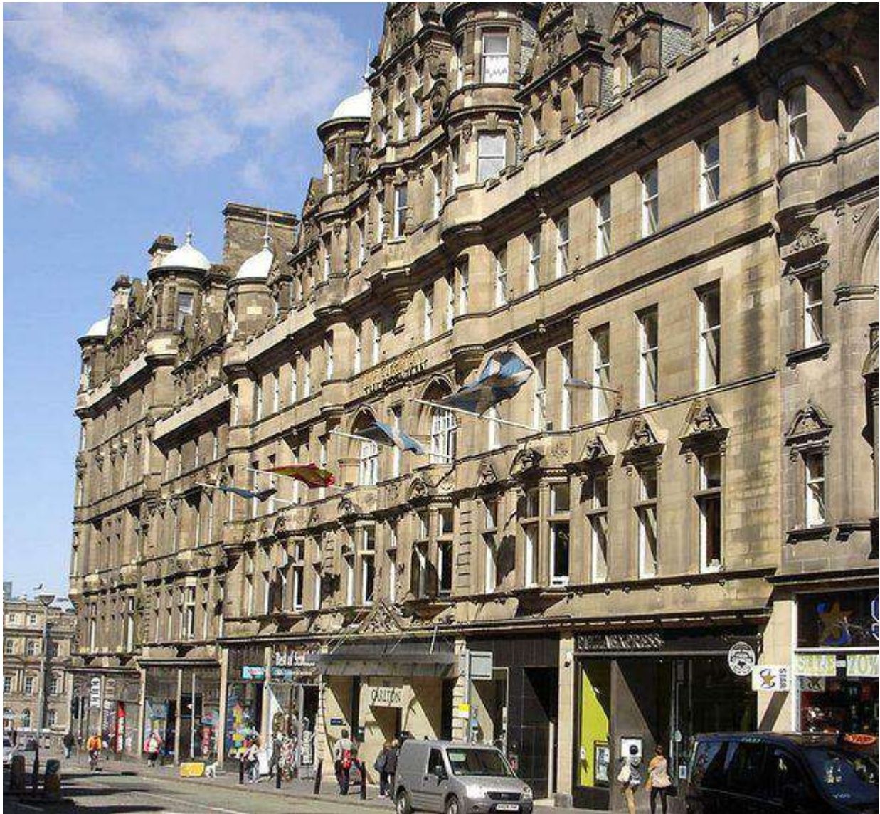
Edinburgh's Carlton Highland Hotel where the prom night took place