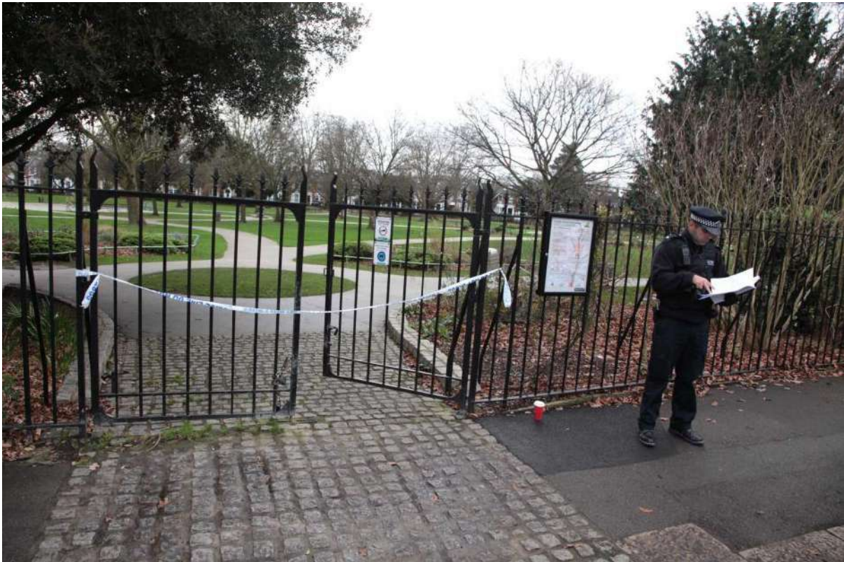
A policeman stands guard at South Park Gardens in December